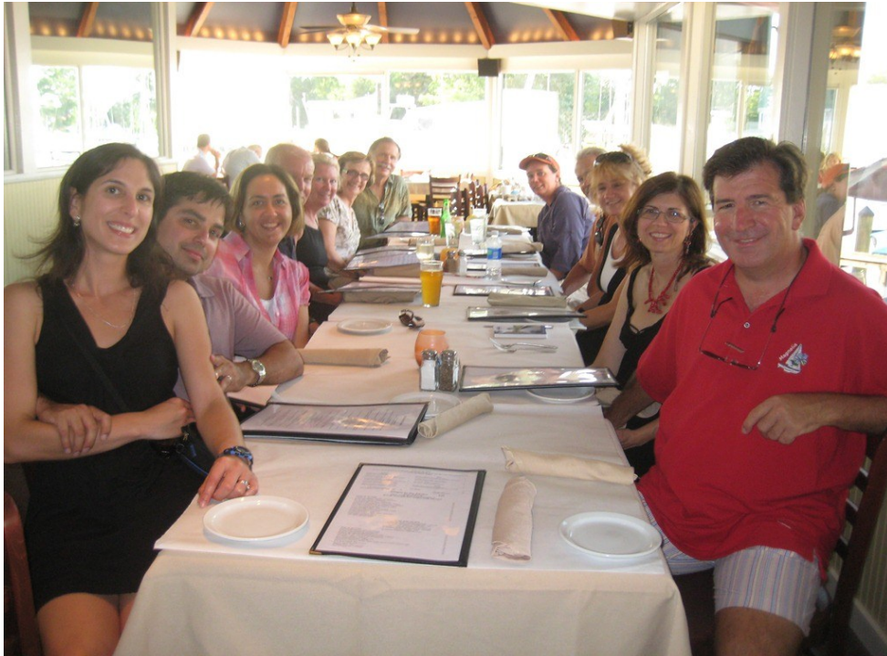
MAGNOLIA and TIME FOR US