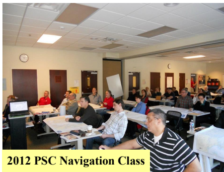
2012 PSC Navigation Class

These classes teach good stuff at very reasonable prices. Most classes are taught by our own in-house PSC experts and aimed at those who want to learn more about sailing. In particular, for those of you who are or are interested in becoming Bay Skipper Candidates, the WTP was made for you.