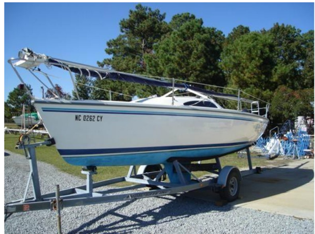
“Lagniappe” 2001 Catalina Capri 22

2003 Catalina Capri 22 Relocated from Oriental, NC Hull Material: Fiberglass Engine/Fuel Type: Single Gas