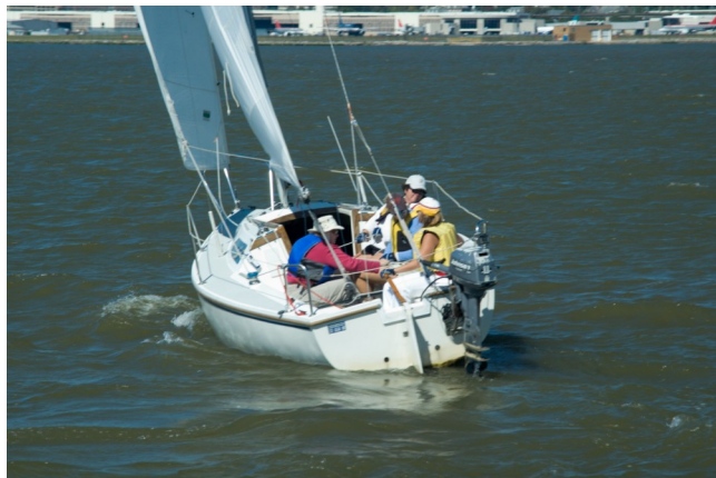
PSC Hydrilla Cup racing in an earlier and gentler year.